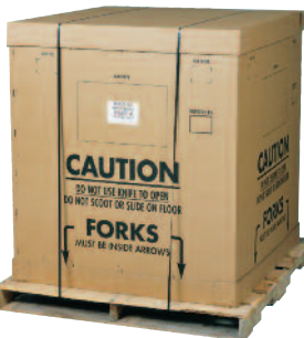
Corrugated Pallet Clean, neat and compact for your convenience.