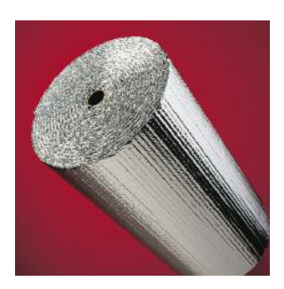
<u>Reflective Insulation</u> Installation Instructions: (There are 2 options) 1. Directly to Roof Deck - Above Fiberglass - Southern Zone of the USA Only

There are two methods for installing Reflectix products in a Cathedral Ceiling. For the Regional Recommendation on which installation method you should consider for your home, please utilize the "Zip Code Zone Locator" function at www.reflectixinc.com/zip-code-zone-locator, or contact our Customer Service Group at (800) 879-3645.