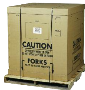
Corrugated Pallet Clean, neat and compact for your convenience.