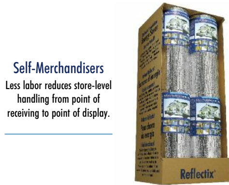
Self-Merchandisers Less labor reduces store-level handling from point of receiving to point of display.